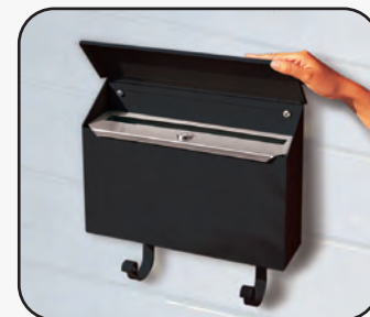
#4610 with optional security kit (#4611) displayed