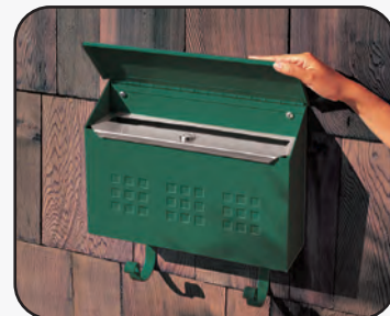
#4615 with privacy plate (included) and optional security kit (#4611) displayed