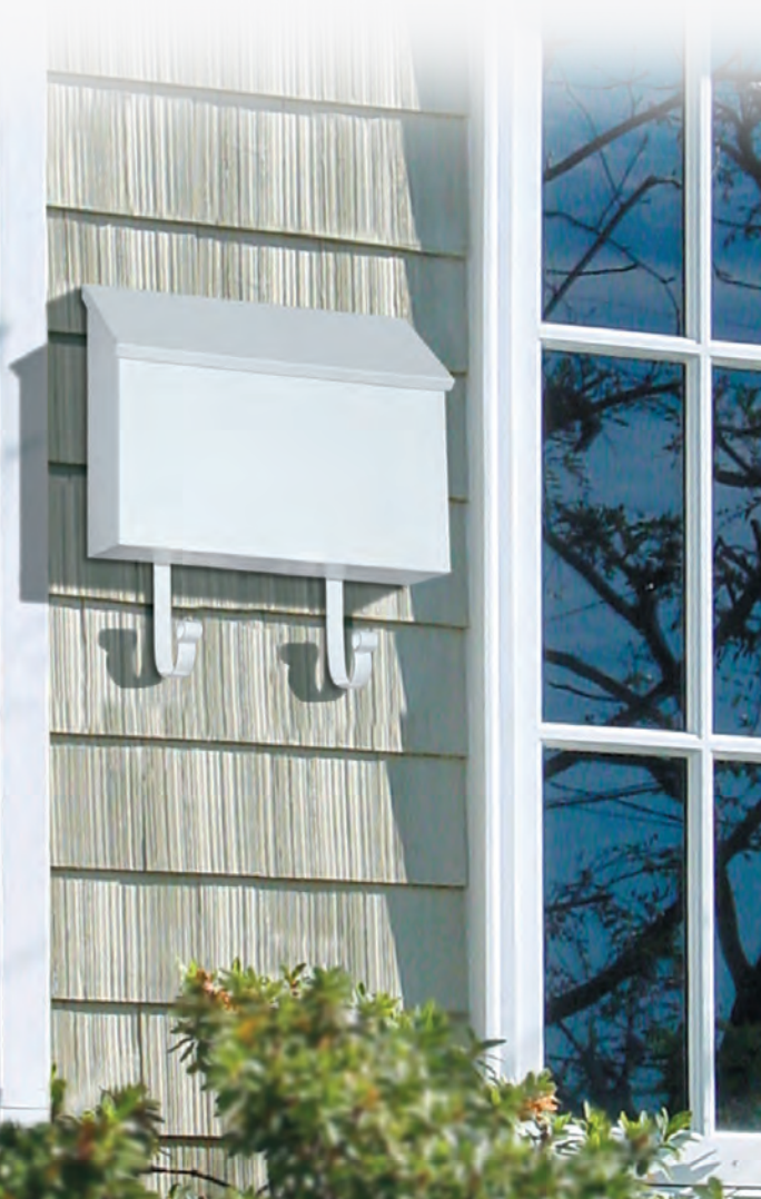
#4610 with magazine hooks (included) displayed

Volume Discount Pricing Available at Mailboxes.com!