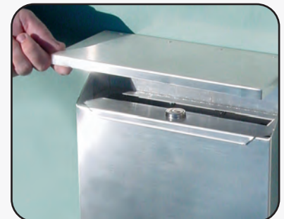
#4520 with optional security kit (#4521) displayed